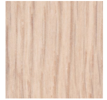
Bleached White Oak

pba products can be customized with FSC certified wood. Minimum quantity requested.