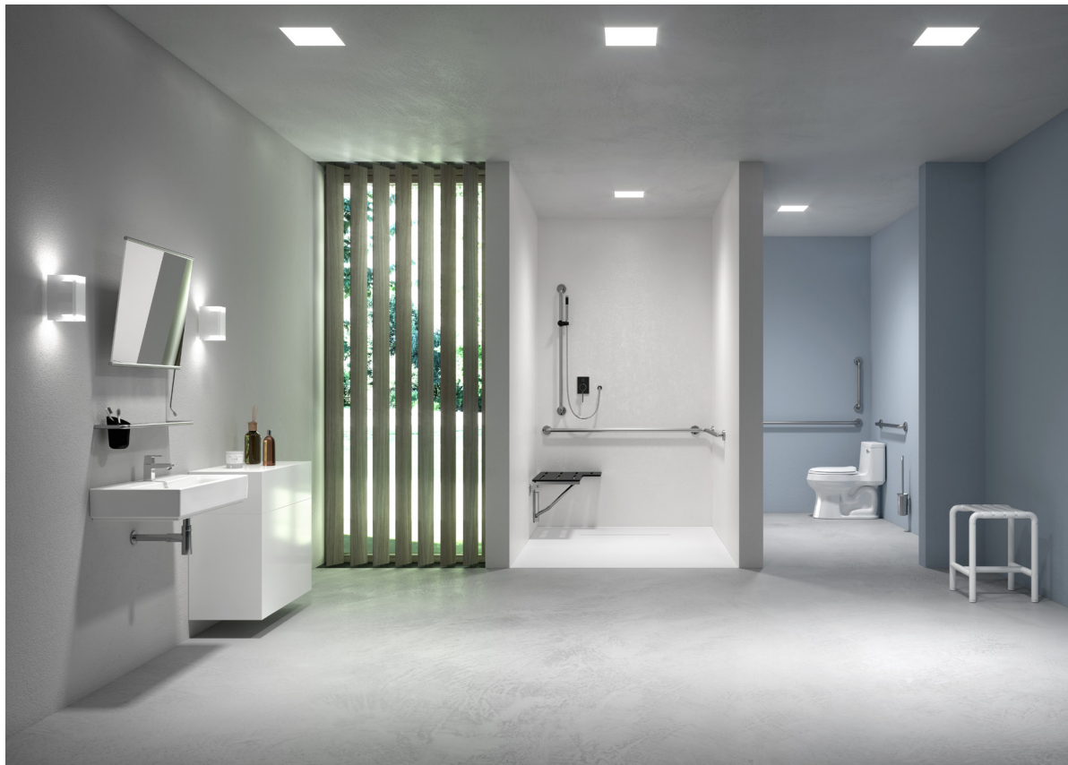
DESIGN FOR ALL 4CS STAINLESS STEEL GRAB BARS AND BATHROOM ACCESSORIES