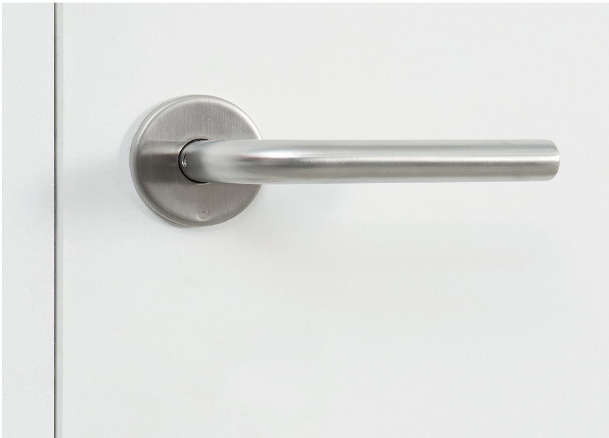
PROGRAMMA 2000 STAINLESS STEEL HANDLES AND DOOR ACCESSORIES

HOW MANY TIMES A DAY HANDRAILS, HANDLES AND LEVERS ARE TOUCHED BY DIFFERENT HANDS EVERYWHERE AND SPECIFICALLY IN PUBLIC SPACES, OFFICES AND HOSPITAL?